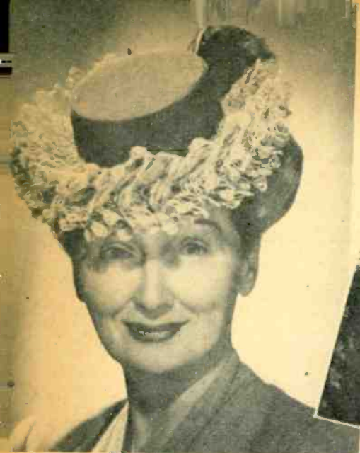
▲ FREQUENTLY DUBBED "THE HAT," due to her big chapeau collection, CBS air columnist Hedda Hopper, another of the half-dozen best-dressed, likes modeling headgear. Here she wears a high-crowned sailor of navy blue grosgrain with a fluted brim of honey-colored straw, designed by Casper-D.