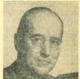
"FAMOUS MUSICAL FAVORITES" with